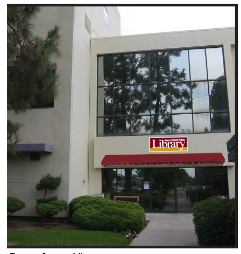
Fresno County Library Senior Resource Center Exterior Signage 6/11/08