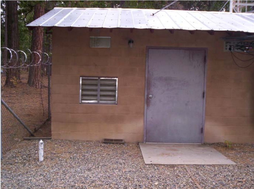
Outside View of the Building