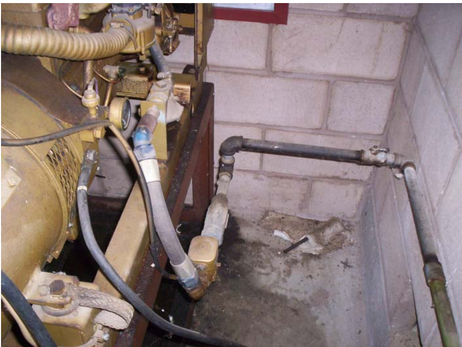
Vapor Propane connection to existing Generator with Shutoff Valve \frac{3}{4} "