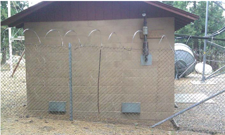
Outside building Exhaust View. New Exhaust system must contain a spark arrestor per US Forestry Service requirement.