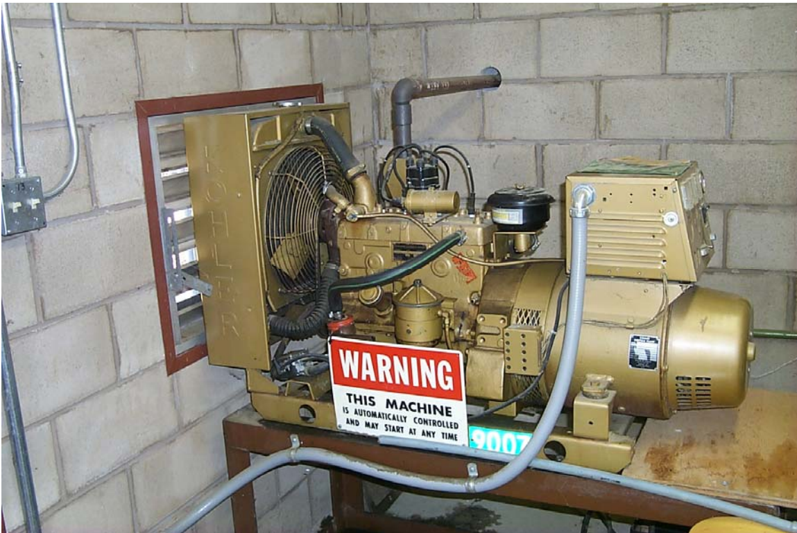
Existing Generator to be replaced by the project.