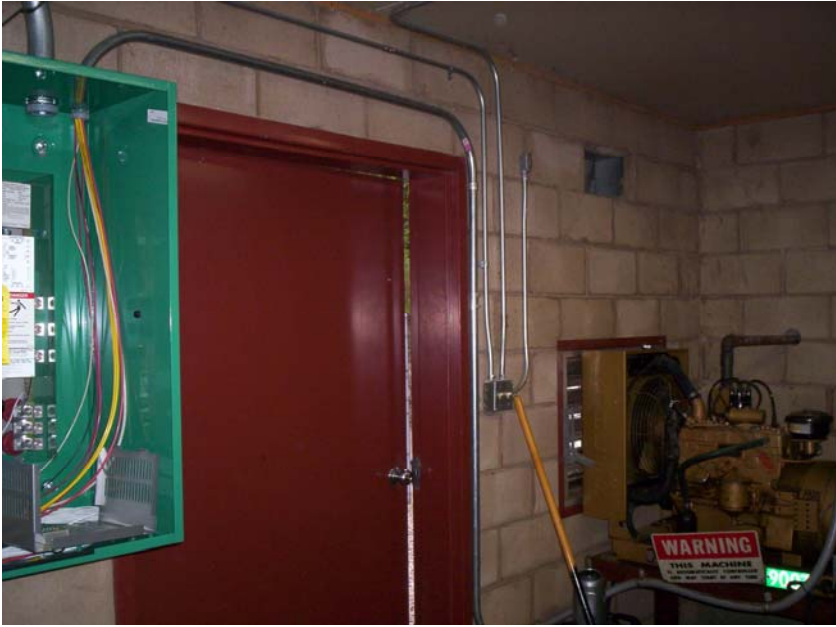
Transfer Switch 1" Conduit with Flex connecting to existing Generator. To be replaced as part of the project.