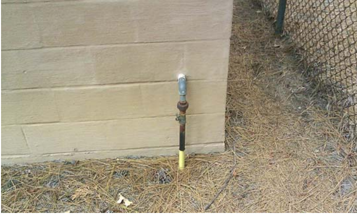
Vapor Propane Entrance 3/4"