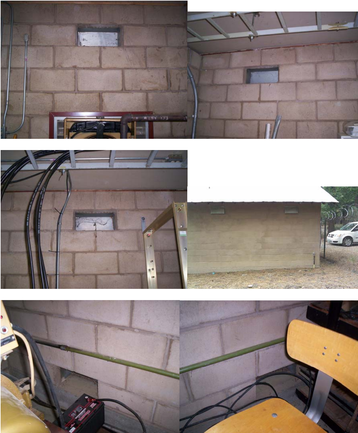
5 Existing Intake Ventilation Ducts Placed around the Room for Air Intake