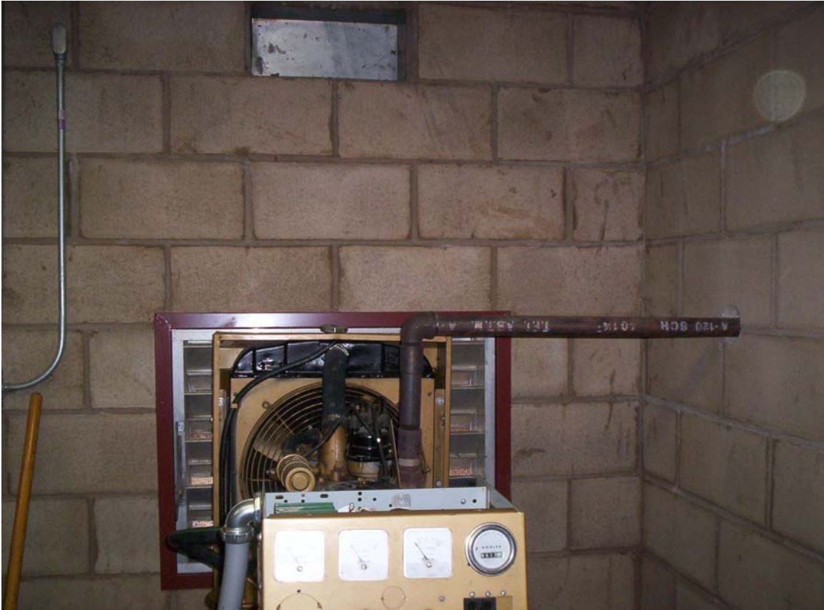
Ventilation Inlet duct above Generator