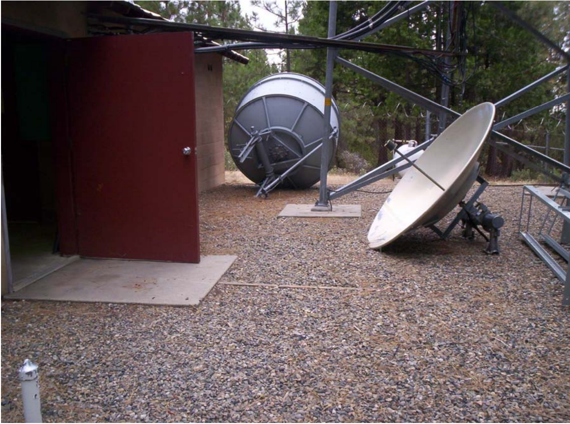
Site Door Entrance Access.